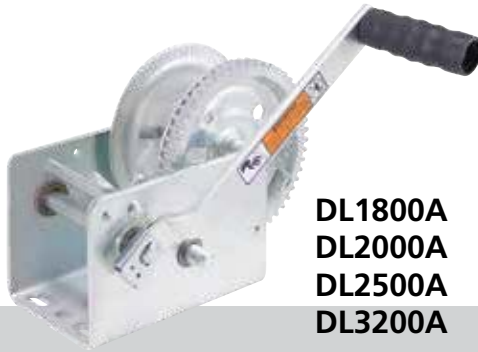
DL1800A DL2000A DL2500A DL3200A