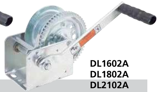
DL1602A DL1802A DL2102A